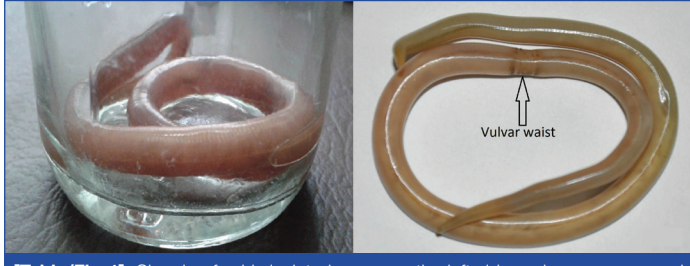
[Table/Fig-1]: Showing freshly isolated worm on the left side and worm preserved in formalin on the right side.

The worm received in the microbiology laboratory was studied carefully. The body of the worm was elongated, un-segmented, cylindrical, tapering gradually at one end, somewhat less so on the other end. Colour of the worm was pinkish cream. A lateral line was seen as a whitish streak along the entire length of the body. Total length was 23 cm, and diameter of the body was about 4-5 mm at the widest point. The posterior end was straight. Vulvar waist was seen, well developed, situated at junction of anterior and middle one thirds [Table/Fig-1].